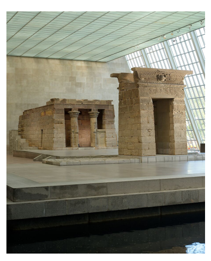
Figure 1. Comparative Illustrations of the Temple of Dendur