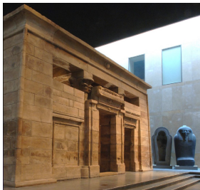
Figure 2. Comparative Illustrations of the Temple of Taffeh

and major topographical features, while red granite represents the public areas. This deliberate selection aims to clearly demarcate the distinction between the reconstructed sections and the original parts of the temple complex, signifying the importance placed on the permanence and maintainability of materials. Ultimately, by imbuing the temple with greater depth to captivate more attention and introducing modern elements into the exhibition environment, the museum can provide a comprehensive and profound experience while ensuring the security and integrity of the temple (The Metropolitan Museum of Art, 2023). In conclusion, the alterations that have taken place since the bestowal of the Temple of Dendur upon the Metropolitan Museum of Art in New York hold significant academic significance in terms of its preservation, exhibition, and visitor experience. These changes exemplify the museum's responsibility and reverence towards cultural heritage, allowing viewers to better appreciate and comprehend the historical and cultural value that the Temple of Dendur embodies.