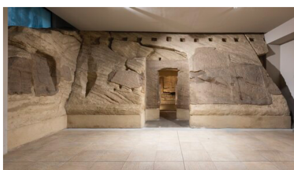
Figure 4. Comparative Illustrations of the Temple of Ellesiya