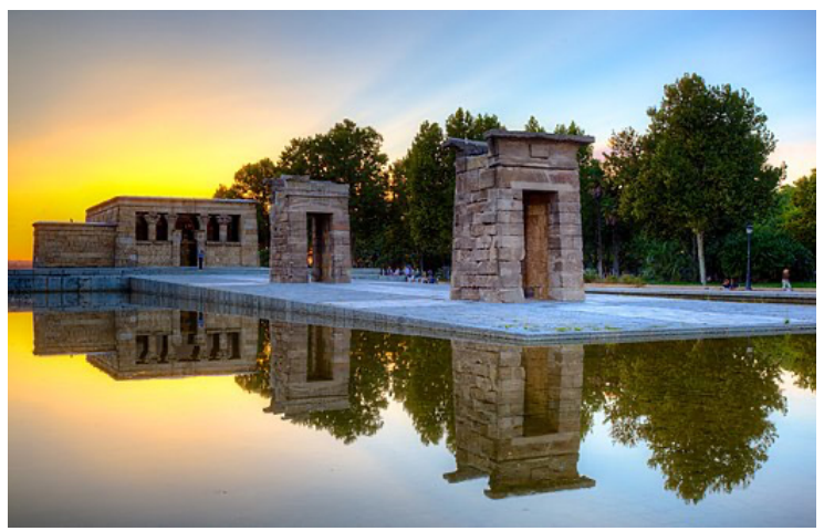
Figure 3. Comparative Illustrations of the Temple of Debod

attracting widespread societal acclaim (Rijksmuseum van Oudheden, 2023; Torgny, 1987, pp. 140–141). The dismantling, transportation, and reconstruction process of the Taffeh Temple exemplifies the complexities of heritage Qiaoyi, as well as the challenges it poses to the preservation and exhibition of cultural heritage. The museum not only retained the temple's original features but also adapted them to meet the exhibition needs. Additionally, the redesign of the temple's surroundings turned it into one of the largest art museums in the Netherlands, highlighting how heritage Qiaoyi can impact local urban planning. Overall, the Qiaoyi process of the Taffeh Temple sheds light on the significance of protecting, exhibiting, and facilitating the circulation of cultural heritage for social and cultural development.