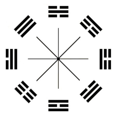
Figure 1. A Diagram of the Eight Trigrams

To the Yijing authors, the unfolding of the universe is vividly portrayed in the 8 trigrams and 64 hexagrams. For instance, they see the 8 trigrams ( \equiv , \equiv , \equiv , \equiv , \equiv , \equiv , \equiv , \equiv ) as graphic representations of the mixing of the yin and yang cosmic forces (or qi, energy). With different combinations of a straight line (—) representing the yang cosmic force, and a broken line (—) representing the yin cosmic force, a trigram symbolizes the cosmos' constant renewal and its creation of the myriad things.